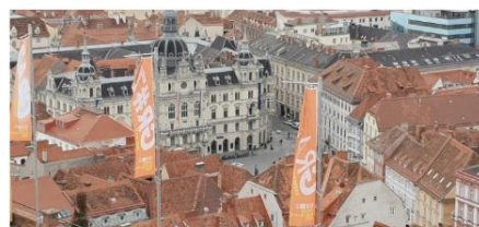
Bound: Exploring Graz with a magnifying lens