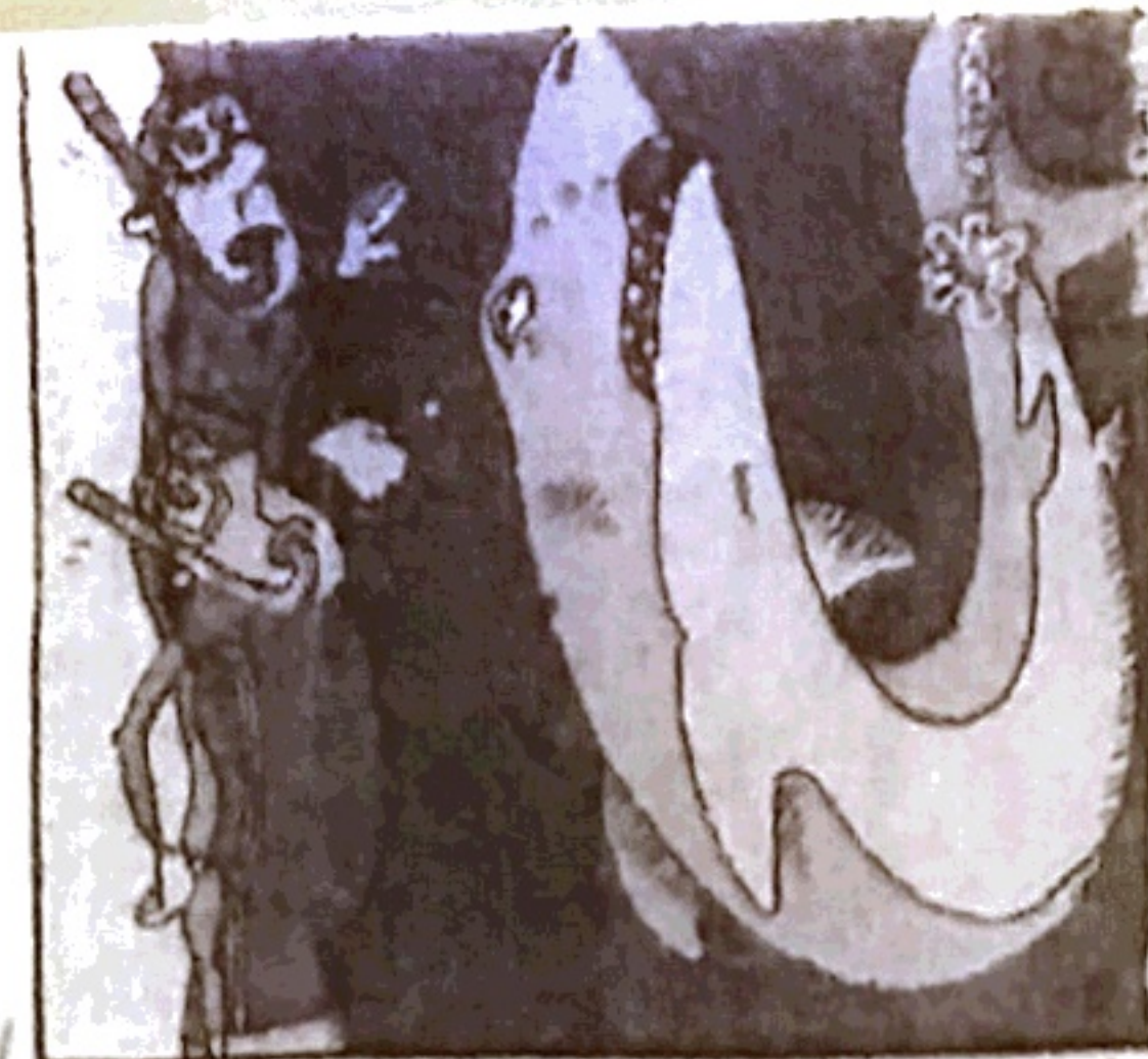
"I think he wants you to play ball!"

Now, ice is melting and flowing into the ocean. The sea level is going up and people on islands and cities near the sea will be in trouble. The sea level rose by 20-30 centimeters. Island has been flooded by salt water. This means that people do not have any fresh water to drink anymore and that they cannot water their vegetation in the fields.