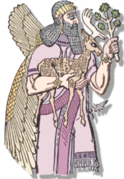
Nimrod may have been the first Santa Claus.

Notice the similarities between Nimrod and Santa Claus.