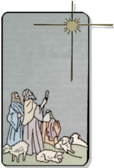
Humble shepherds visit Christ at His birth site.

Just as it is illogical for shepherds to be watching their flocks out in the fields on a cold winter night, certainly it is illogical to conclude that Mary and Joseph and all the other travelers would have made their way to the city on a cold winter night. Many of the travelers may have had to journey from very long distances to get to the city, and it is unlikely that they would have done so in the cold of winter