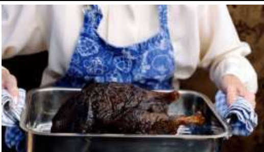
I've burnt the meal.