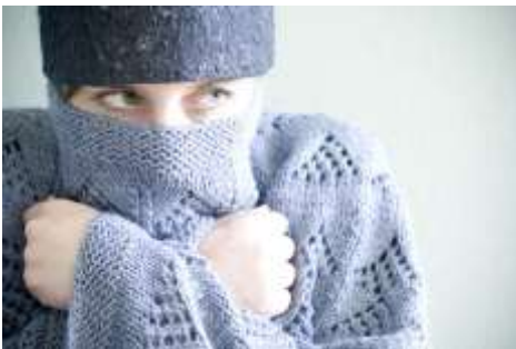
I am freezing.