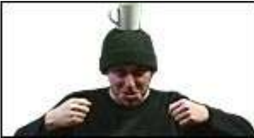
I lost my temper (got angry).