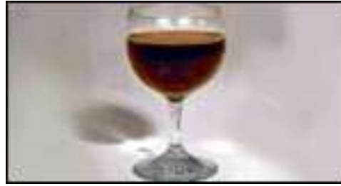
I've got a terrible hangover.