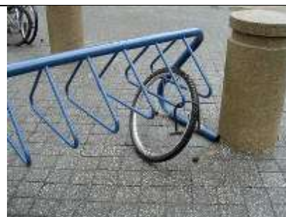
My bike was stolen.