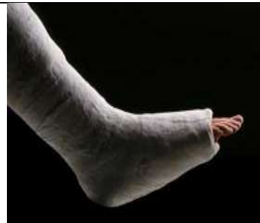
I have broken my leg.