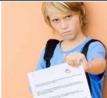
I have failed the Biology test.