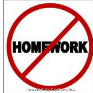
I forgot to do my homework.