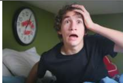
I was late for school.