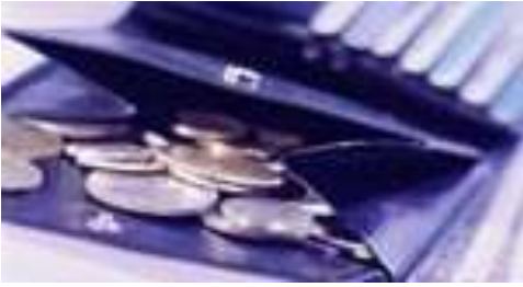
I've spent all my pocket money.