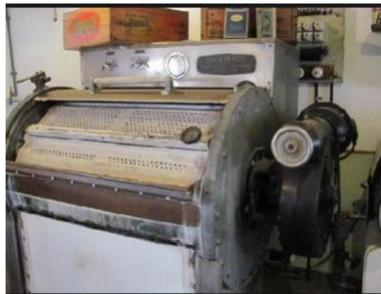
Miele washing machines, since 1956