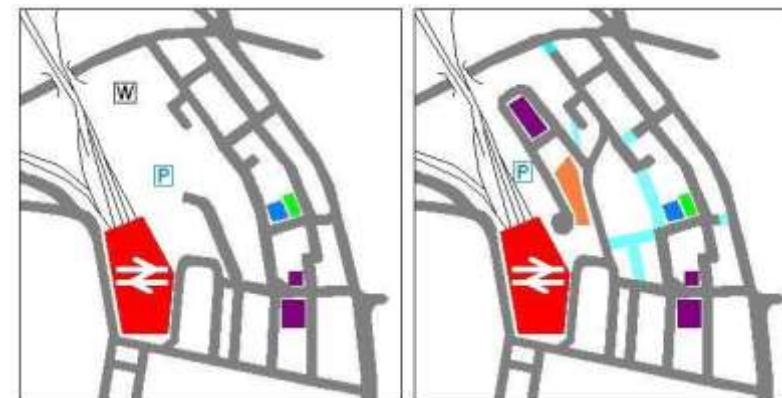
New England Quarter, Brighton - before (left) and after redevelopment.