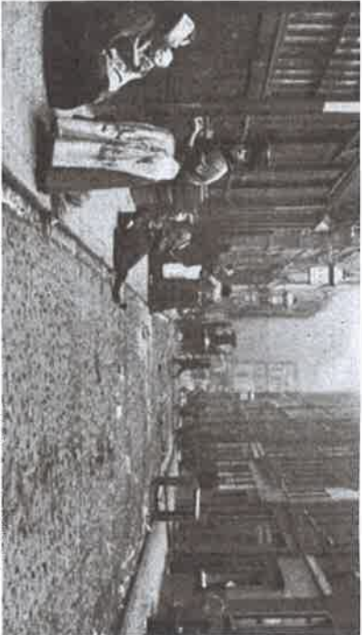
http://images.americanetworks.com/bc/america.com/wp-content/blog.dir/86/files/2012/12/STORY-4dones-see-1.jpg White chapel in 1888

2 women and children that washed and sewed for other people. The rest of the people in the third class are laborers, coalers and criminals. The people in the third class were the poorest. They had never enough. Many people drank alcohol to escape their situation. Women often became prostitutes because they had no money. In 1888 were about 1200 of them only in white chapel. The police didn't care about all these things so a lot of crime and violence was committed in this time. Because of so much crime and violence it didn't even stand in the newspapers when a prostitute called Emma Smith got attacked on the third of April in 1888.